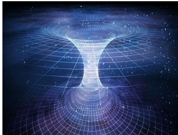
FIG. 1. Interaction of gravitational energies.

Gravitational fields have energy and therefore participate in gravitational interaction. Force interaction of gravitational energies occurs ( FIG. 1 ).