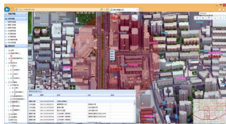
Figure 5 : A quick search and statistics

The system realizes category search and precise search about roads, buildings, public facilities, person and digital via setting the quick search bar module. The main function of statistics realizes fast statistics for all data units, similar attribute naming body within the database. According to the required data item requirements of the selected range by staff, the system will automatically select data in the light of the conditions within database and finally, show the digital results of two community above [5] . As shown in figure5.