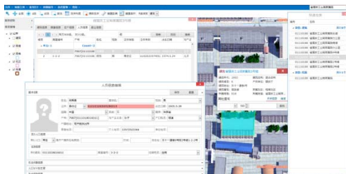
Figure 4 : Social security and volunteer service

The system provides social security and volunteer service functions, including social relief, labor security, family planning and volunteer service module and establishes civil target archives tracking service (including the subsistence allowances, medical insurance, low rent housing, medical assistance, the aged, the disabled, entitled groups), and establishes accounting of labor security information for the employees and the unemployed within the jurisdiction [3] . Tracking and managing the married women of childbearing age reflecting their marital status, family status, whether receiving only child fee and other related information. To form detailed work of family planning and file information of the full, the system emphasizes on management and investigation of floating population [4] . As shown in figure4