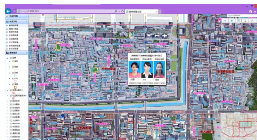
Figure3 : 3D Scene and information annotation

All kinds of objects in jurisdiction, especially those objects attached to ground like roads, buildings public facilities is modeled independently relying on their scales. Drawing simulation of 3D graphics of BaiShuling on the basis of each unit constructed before not only makes it overall and intuitive in understanding and mastering the general conditions of jurisdiction but also has scaling, rotating, annotation, information management of road and building facilities, labeling on administrative departments at all levels of the area boundary and geographic information measurement function, as shown in figure 3.