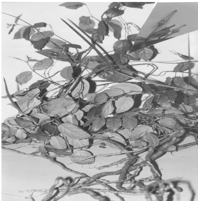
Plate 1: Photograph of the morphological features of C. sanguinolenta

The plant now belongs to the family Periploaceae, although it had earlier been classified as a member of the family Asclepiadeceae 11 .