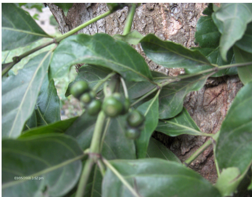
Plate 4: Fruits of M. lucida in ball-shaped measuring 1.5cm in diameter. Taxonomic review of Voacanga africana Stapf

V. africana Stapf belongs to the family Apocynaceae. The genus, Voacanga