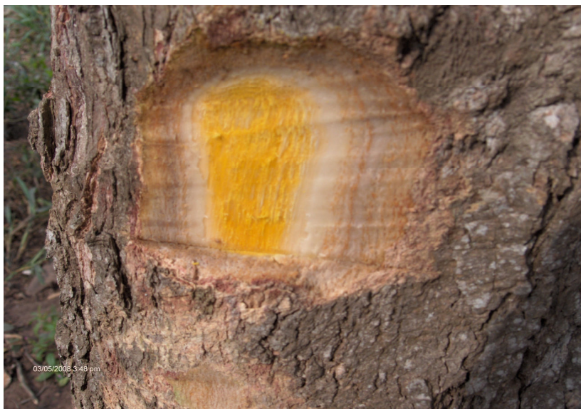
Plate 3: Grey bark with slash bark yellow to orange brown of M. lucida