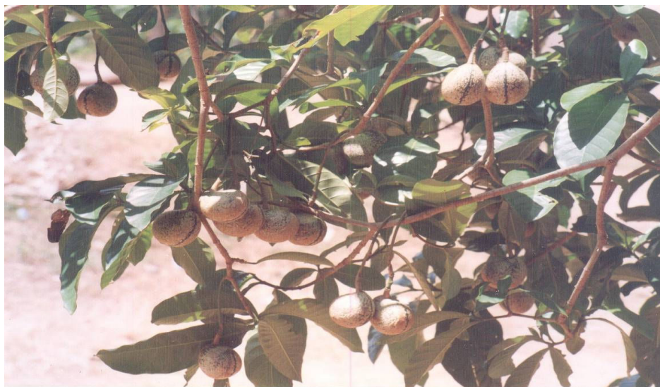
Plate 5: Photograph of an aerial part of V. africana (x1) showing some fruits

includes Voacanga bracteata , Voacanga obtusa and Voacanga Africana , which are common in West Africa. In Ghana, the plant species is locally known as “Kakapempe” in the Ashanti Region and “Ofuruma” in Nzema in the Western corner of Ghana.