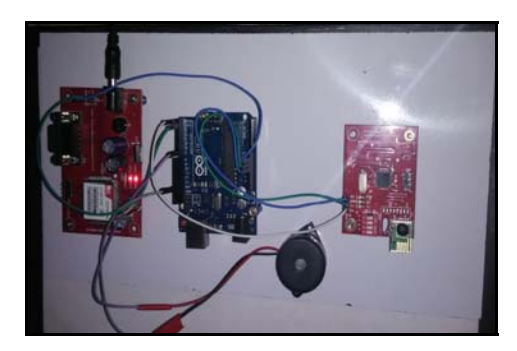
Fig. 3: GSM module

This paper describes the foundation of an efficient tool to generate digital data signals from legated paper charts. The solution proposed is a low-cost software tool that can be particularly helpful to scientists and engineers. In particular, research institutes, laboratories, clinical center's, hospitals and medical offices can largely have benefit of this up-and-coming technique, particularly due to its user friendliness, cost-effectiveness, and accuracy. One still can save data as MATLAB file or as ASCII files and edit or complement the data.