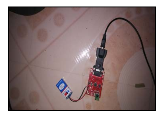
Fig. 3: Transmitter module

In this paper, an efficient method for extraction and digitization of ECG signal from various sources such as thermal ECG printouts, scanned ECG and captured ECG images from devices is proposed. The methodology produced a reasonably accurate waveform that is free from printed character and as tested through heart rate, QRS width and stability calculations.We propose MATLAB software for the Pan and Tompkins QRS detection algorithm for detection of diseases related to heart, implementation every stage processes the entire sample and then can the next stage begin.