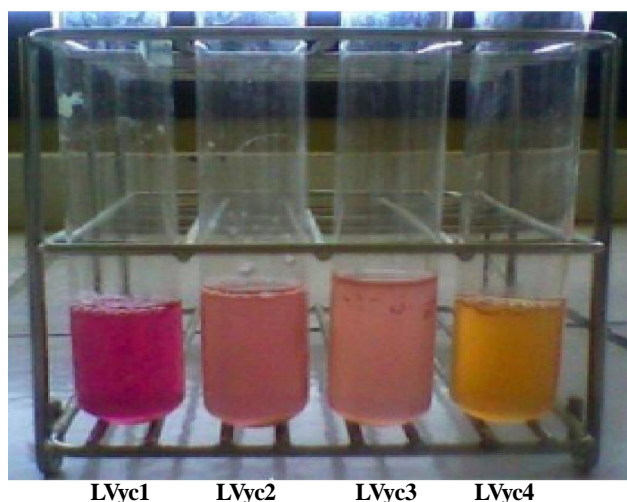
Figure 1 : Visual assessment of urease activity of yeasts after three days of culture on the tryptophan urea environment at 30°C and pH 6.8. yeasts LVyc5 and LVyc6 behave like LVyc4

The strains tested are yeasts isolated of the wort of fermentation prepared beforehand. TABLE 3 gives the origin of the six isolated strains.