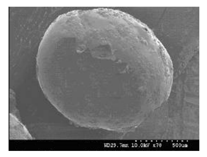
Fig. 1: SEM of ethylene vinyl acetate copolymer (EVA) microcapsules, EVAMC1, (size 10/20) of pioglitazone

Low c.v. (< 2.0 %) in percent drug content indicates uniformity of drug content in each batch of microcapsules (Table 1). The microencapsulation efficiency was in the range of 95.0-101.25%. Drug content of the microcapsules was found to be nearly the same in different sieve fractions. As the microcapsules are spherical, the theoretical mean thickness of the wall that surrounds the core particles in the microcapsule was calculated as described by Luu et al.<sup>10</sup> Microcapsules prepared by employing various ratios of core : coat were found to have different wall thickness. Smaller microcapsules have thinner walls.