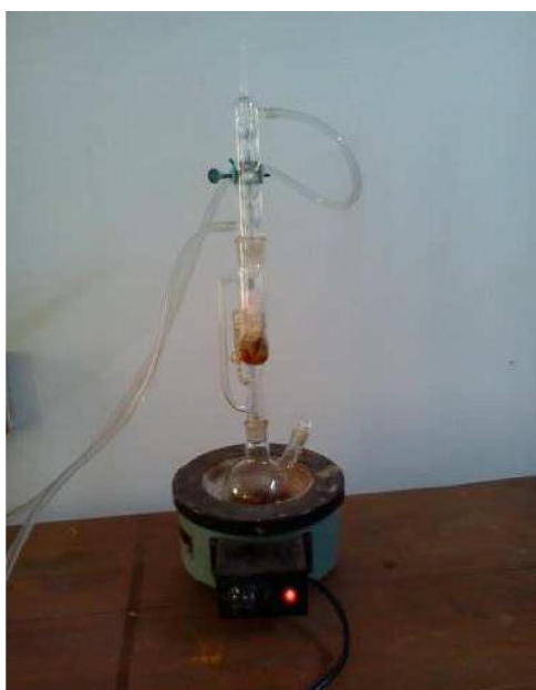
Figure 1 : Soxhlet Extraction Apparatus

Prior to the solvent extraction study, 200ml of 80% methanol was prepared and was kept still of the extractor. 2 grams of Skin of Allium cepa was placed in thimble with the help of a filter paper and then the condenser was connected to it. Now the total apparatus was placed in the heater. Using the soxhlet apparatus continuous extraction was done for 10 hrs.