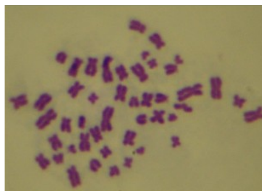
Figure 9 : Chromosomal study case 3

3:2), Radial hemimelia is bilateral in 50% of cases and the right side is more commonly involved than the left (with a ratio of 2:1). Approximately 5-10% of radial hemimelia cases are familial but the etiology remains unknown [9] . The deformities are believed to develop early in pregnancy, between the 28th and 56th day of gestation.