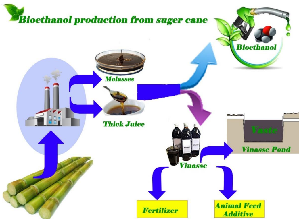
SCHEME 1. Different stages performed on sugarcane to change into alcohol, whereby vinasse is produced as the byproduct.

Vinasse also shows other effects including insecticide, which can have an inhibitory effect in agriculture, causing biological removal of agricultural pests (Scheme 1). Vinasse can also be used as a fertilizer or supplement along with cake filter. Vinasse has also been used in the production of biogas [2-5].