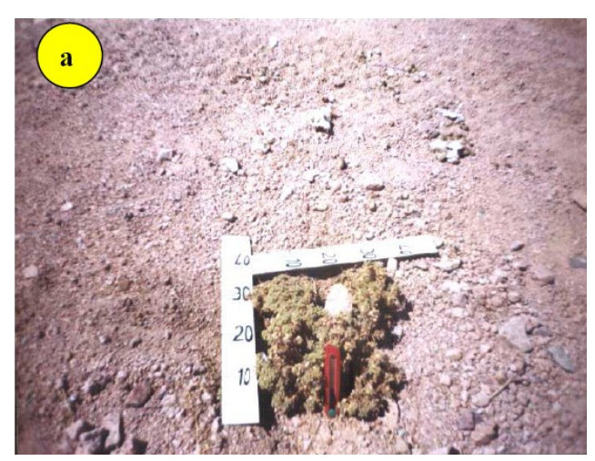
A ruler is put to measure the natural diversions of the plant. This plant measures, 40x40cm