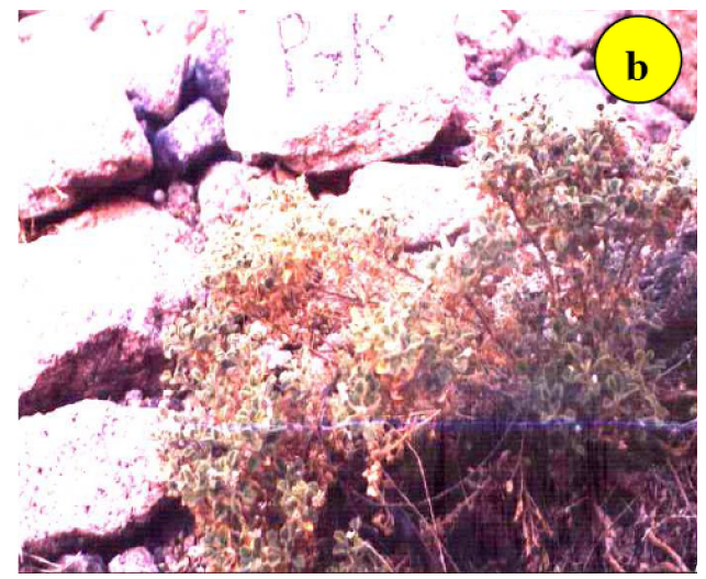
Figure 2 : Fagonia boveana

present study. Soil samples were collected from the four localities and prepared for the determination As, Bi, V, Ga, Cr, and Sn.