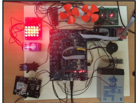
Fig. 2: Hardware circuitry of E-Gateway