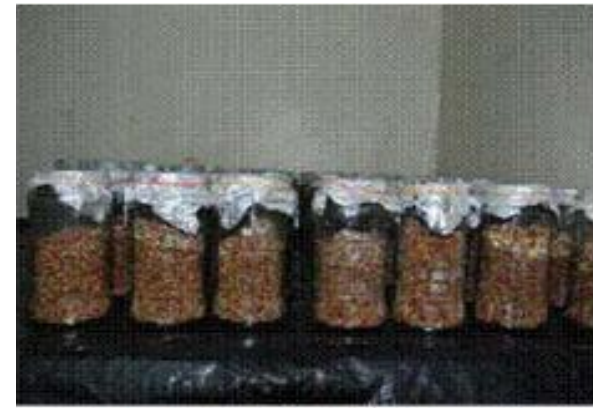
Plate 1: Freshly inoculated wheat grain for mother spawn