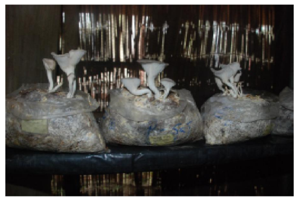
Plate 5 : P. pulmonarius cultivated on oil palm waste