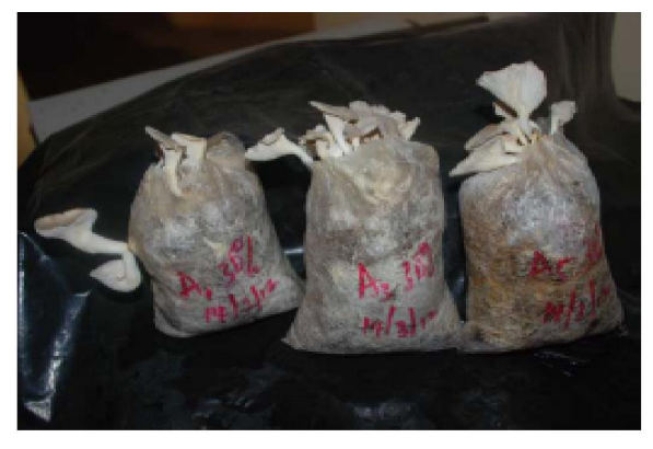
Plate 6 : P pulmonarius cultivated on sawdust