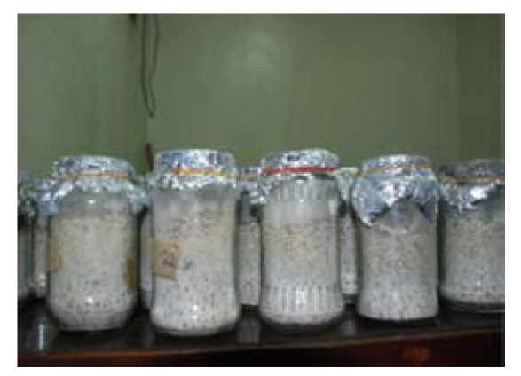
Plate 3: Fully ramified Spawn bottles