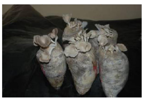
Plate 4 : P. pulmonarius cultivated on coir fibre