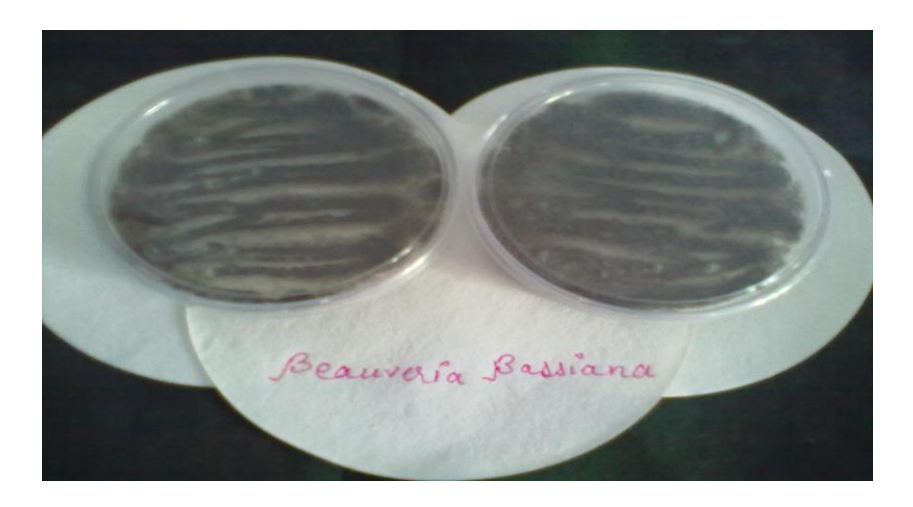
Figure 1: Growth of Beauveria bassiana on PDA

Beauveria bassiana, fungus, is a common pathogen of a range of insects belonging to various gatherings. This fungus often exerts a good degree of natural biological control [101] under humid conditions. In March 2013, genetically modified Beauveria bassiana was found in a number of research labs and greenhouses outside of a designated containment area at Lincoln University in Christchurch, New Zealand. The Ministry for Primary Industries investigated. Depending on the strain, medium, and culture parameters, the fungal biomass is increased via vegetative growth.