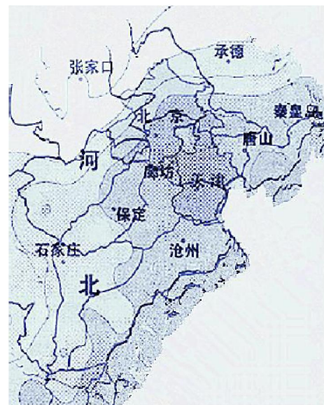
Figure 1 : Administrative haihe river basin

The city is divided into I water area. i = 1, 2, 3, \dots, I , The whole city has J kinds of water supply. j = 1, 2, 3, \dots, J . The use of water resources is di-