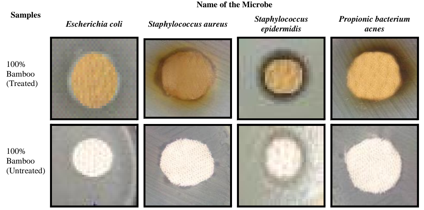
Figure 2: Zone of inhibition of gallnut treated and untreated bamboo samples against the foot odour causing bacteria

100% bamboo fabrics. The results show that gallnut treated 100% bamboo material has higher inhibitory effect towards Escherichia coli , Staphylococcus