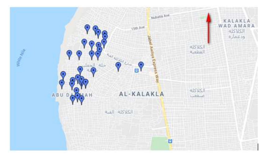
FIG.1. Google earth map for selected samples.