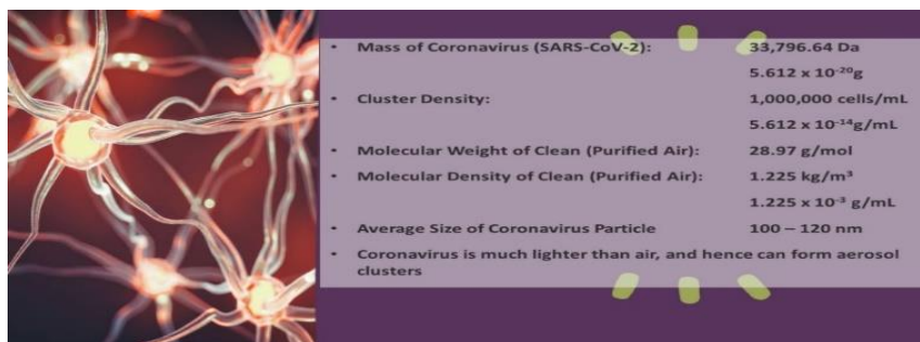
FIG. 2. Cell cluster volume mass computation.

Given the molecular weight of coronavirus as 33,796.64 Dalton and the average size of coronavirus at 100 nm-120 nm, in this work, the total mass of observable laboratory cell cluster density of 1 million cells per mL was compared with the mass/mL of purified air as presented in FIG.2 [12-15]. We concluded that it is not only plausible but also practical for coronavirus to be communicable via aerosol mode. This is further corroborated by the characterization of coronavirus in a “Characteristics of SARS-CoV-2 and COVID-19” by Hu et al. work by where they established that smaller and much more numerous particles known as aerosol can be exhaled by COVID-19 patients, linger in the air for a long time and inhaled by someone else to cause the virus to penetrate deep into the lungs of the new host [16].