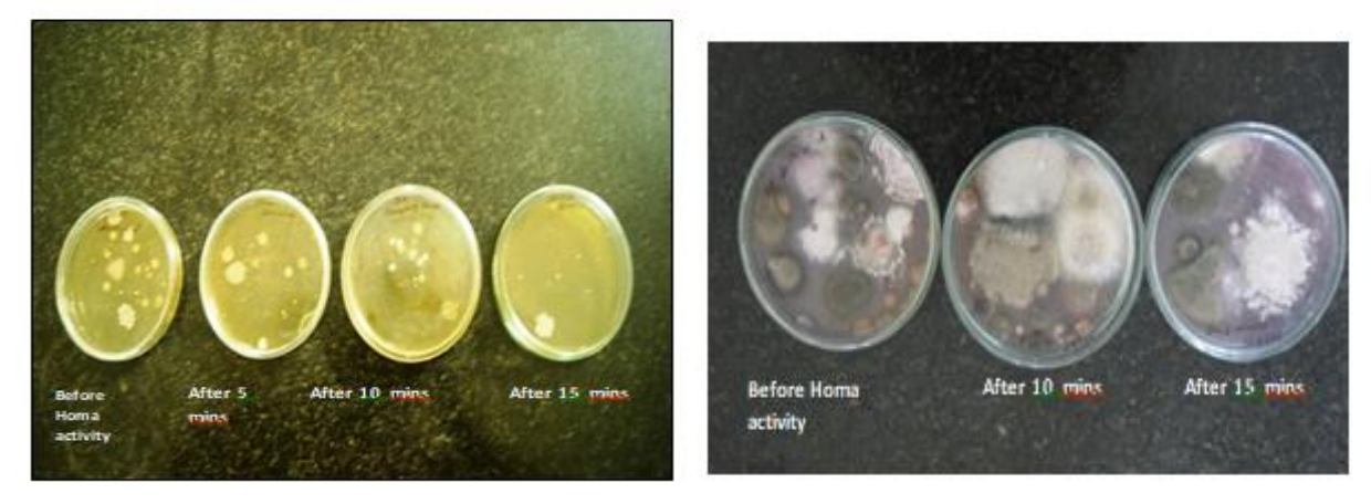
FIG. 3. Depicts the reduction bacterial FIG. 4. Depicts the reduction fungal aerosol after Homa activity.

The bioaerosol reduction after Homa perhaps attributed by metal oxide generated during Homa performance. The metal pyramid used for homa activity made up of with Copper and gold which may produce the Copper Oxide (CuO) during burning process with ghee, fire wood and dry cow dug. Copper oxide is an active catalyst on organic and inorganic constituent present in the dry cow dug and fatty acid containing ghee may produced the various active components like Aromatic hydrocarbons, Acetylene, Methane etc. These active components effected on microbial surveillance in air. The present study supported by Monk [9] tested that Cupron Enhanced EOS Surfaces containing Copper Oxide kill above 99.9% of a wide range of bacteria within two hours of exposure and continue to do so even after repeated contamination and multiple wet and dry abrasion cycles, passing all the acceptance criteria required by the EPA [10].